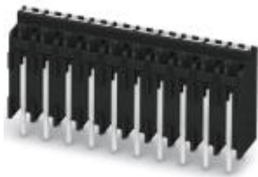
The illustration shows the 10-position version

Please be informed that the data shown in this PDF Document is generated from our Online Catalog. Please find the complete data in the user's documentation. Our General Terms of Use for Downloads are valid ( http://phoenixcontact.com/download )